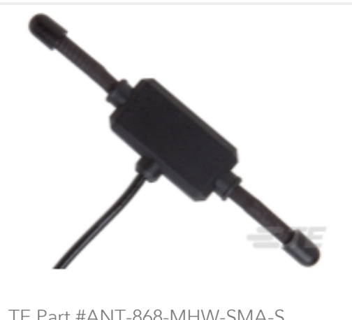
TE Part #ANT-868-MHW-SMA-S Antenna 868MHz Dipole MHW Short SMA